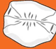
BOTTOM GUSSET SEAL