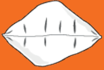
BOTTOM FLAT SEAL