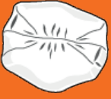
BOTTOM GUSSET SEAL