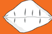
BOTTOM FLAT SEAL