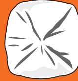
BOTTOM STAR SEAL