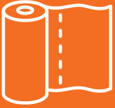
ROLL WITH PERFORATED